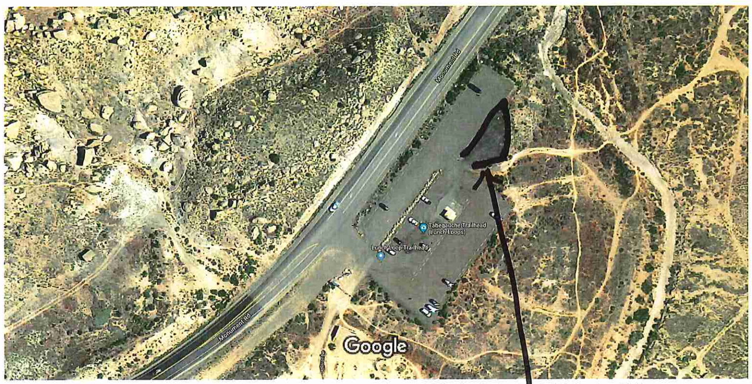
50 ft