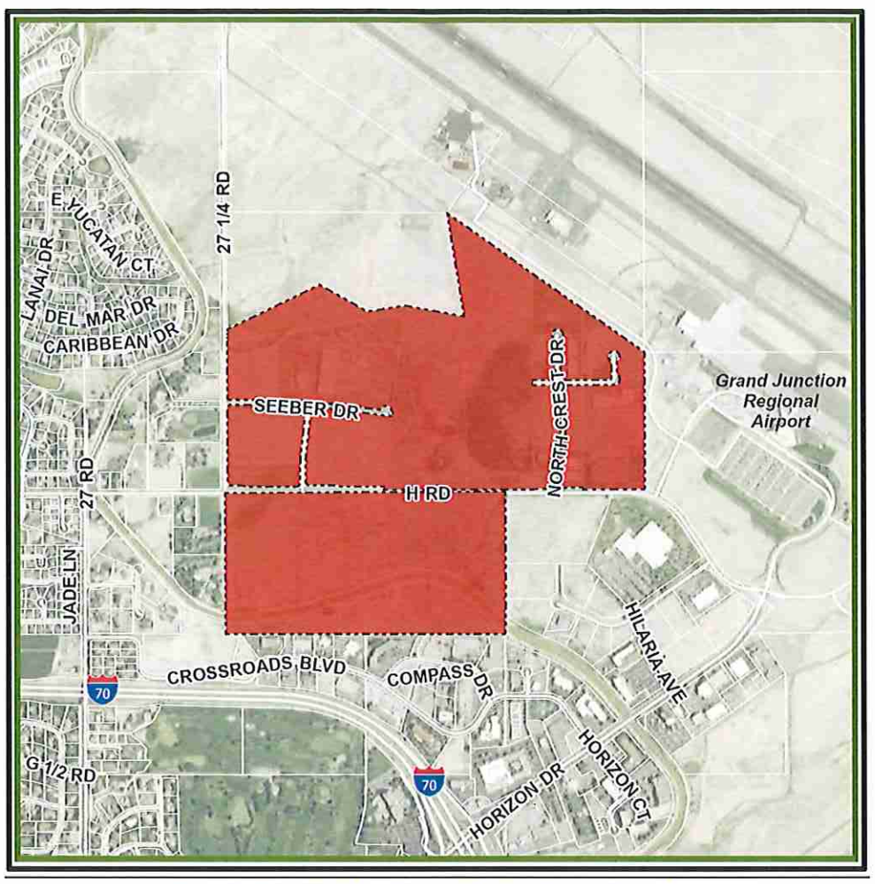
Figure 1 - Cannabis Manufacturer Overlay, Horizon Drive Area