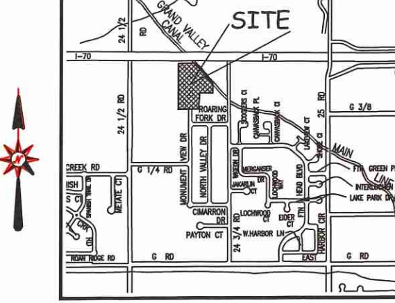
LOCATION MAP: NOT-TO-SCALE